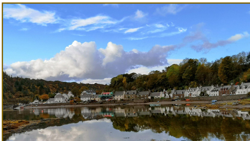
Plockton Bay