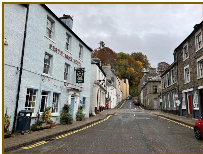
High Street, Dunkeld