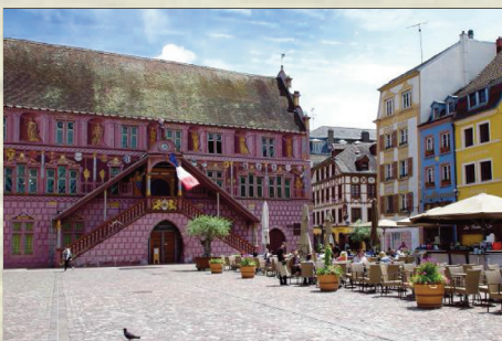
Mulhouse (pronounced Muh-loose)

We'll be based in the art deco Hotel du Parc in the centre of Mulhouse, the second largest city in Alsace - 25 minutes from Basel Airport. Apart from its cafés, shops, galleries and Zoological Gardens, Mulhouse has the largest market in eastern France and one of the world's finest car museums.