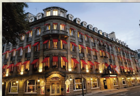
Hotel du Parc